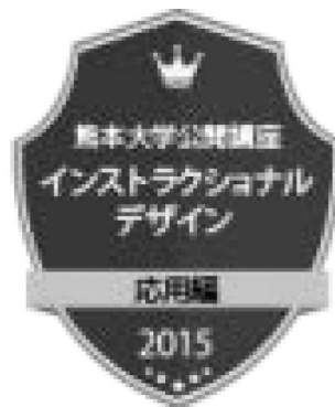
Figure 2. Digital badge icon

The digital badge was developed by combining the standard features of Moodle, an open source LMS (Figures 2 and 3). Specifically, it was issued to participants who met the acceptance of criteria individually using the "course badge" function of Moodle. Furthermore, learning processes and outcomes were linked with the digital badge by pasting a link to a "detailed report" page that listed the learning process and outcomes of the participants in the description of the badge. In addition, individual feedback on the final report from the lecturer was displayed on the detailed information page of badge.